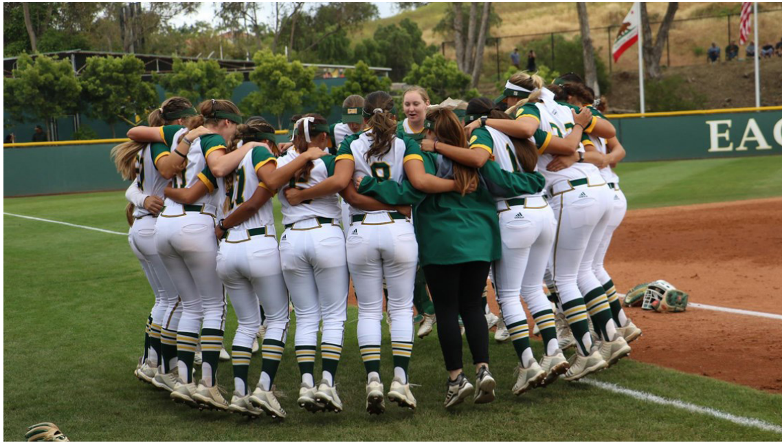
PICTURED ABOVE: The softball team gets ready and excited to take the field.