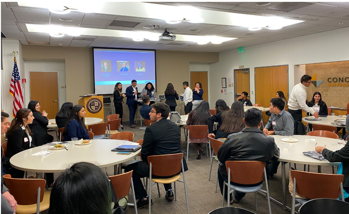
PHOTO ABOVE:: Students network at the annual Winter Mixer.